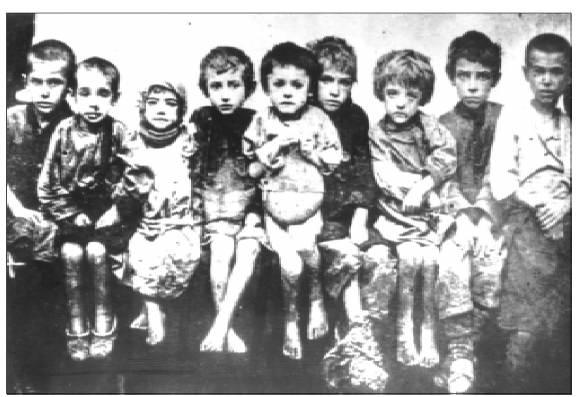
A unique photo taken in 1933 by Gareth of the starving children in the Ukraine. One of the very few pictures that recorded this great tragedy of the Stalin era.