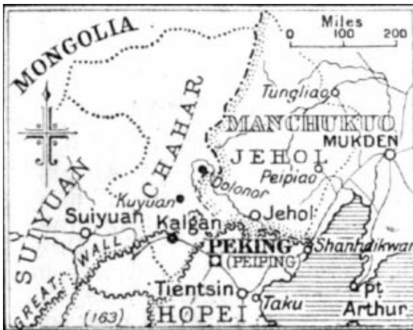
Map of area in which Gareth was captured.

The following day the news hit the national newspapers and it was revealed that the men had been captured on their way back to Kalgan from Dolonor at a place called Pao Ch'ang. The Russian chauffeur who had been captured with them had been sent back with a ransom demand for the sum of £8,000 and 200 Mauser rifles. Apparently the bandits held up the vehicle at a range of 40 yards with rifles and a machine gun, two shots of which hit the engine. They then looted it and carried off the two passengers. The bandits were dressed in uniforms of the Peace Preservation Corps [local police].